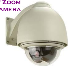
PAN TILT ZOOM SURVEILLANCE CAMERA