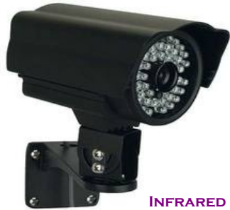
INFRARED IR BULLET VIDEO SURVEILLANCE CAMERA

The Pacific LAPD Community Police Advisory Board (CPAB) is committed to partnering with the Los Angeles Police Department to do all that we can to make our communities as safe as possible.