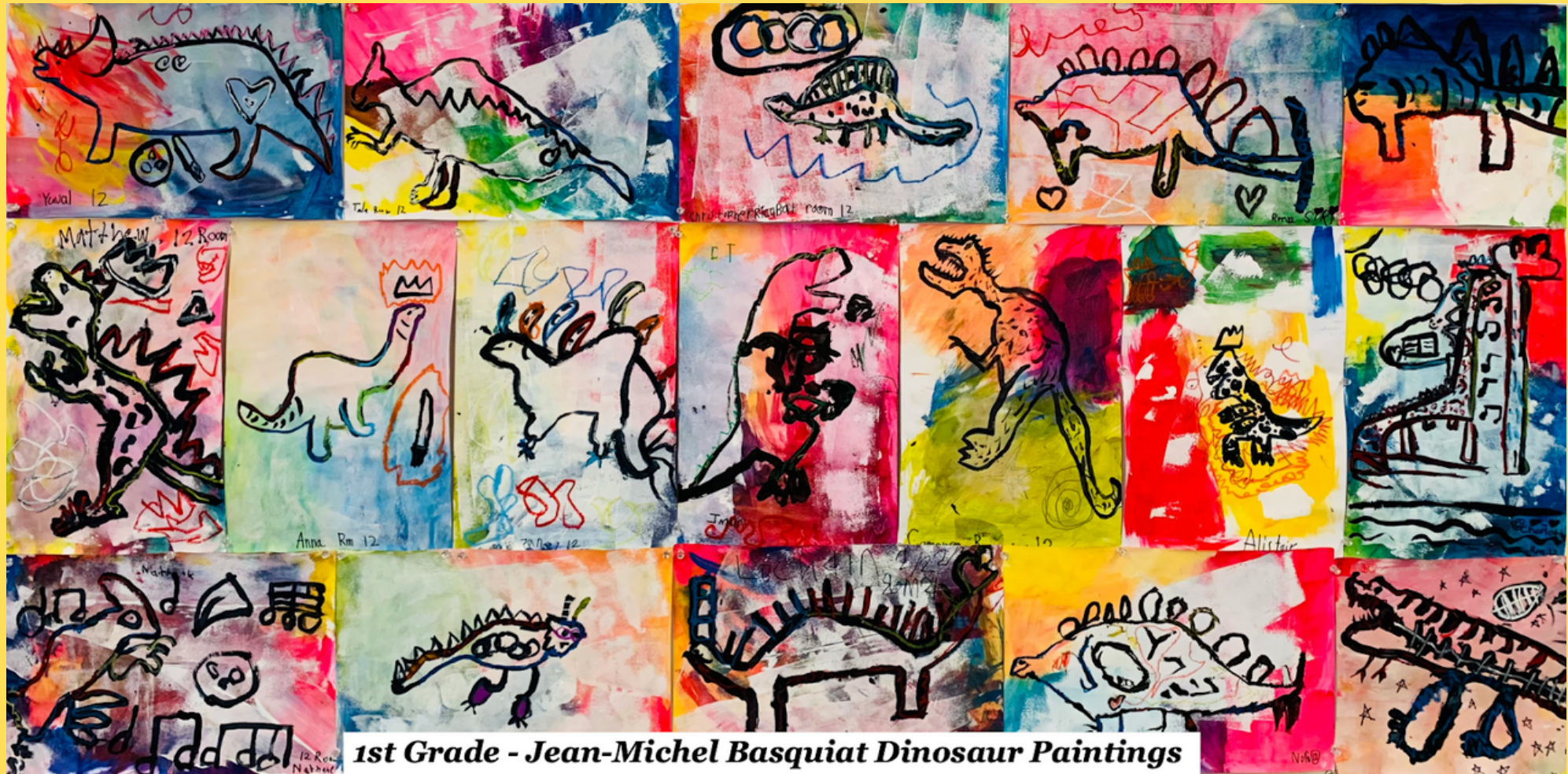
1st Grade - Jean-Michel Basquiat Dinosaur Paintings