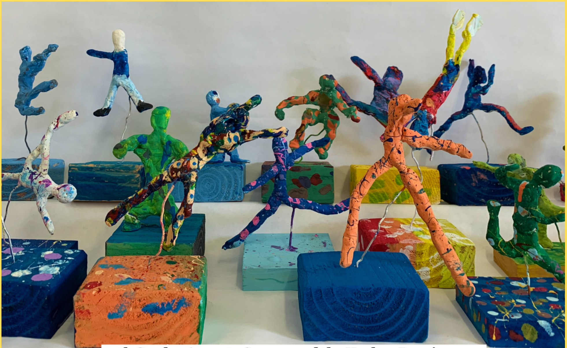
4th Grade - Augusta Savage and the Harlem Renaissance