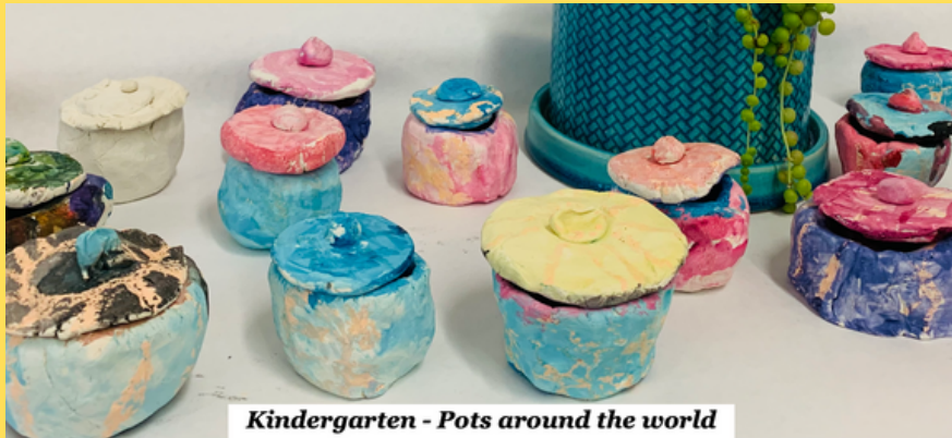
Kindergarten - Pots around the world